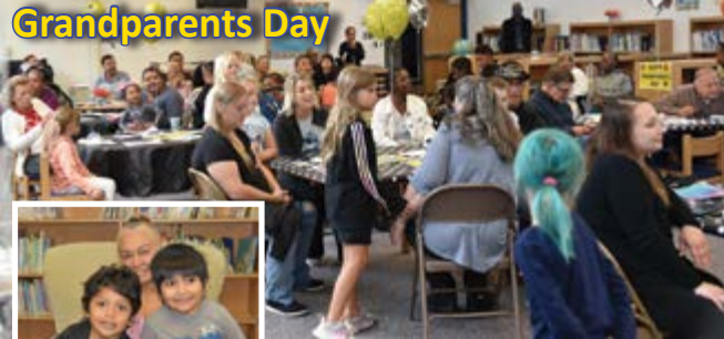
Covert Elementary School's students love showing off their classrooms to their grandparents. Grandparents were then treated to special treats.