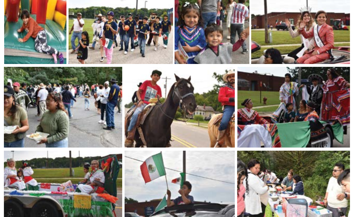
Covert students, staff and families celebrated Mexican Heritage day with a community parade, speakers and a fiesta ending at the Covert Lions hall.