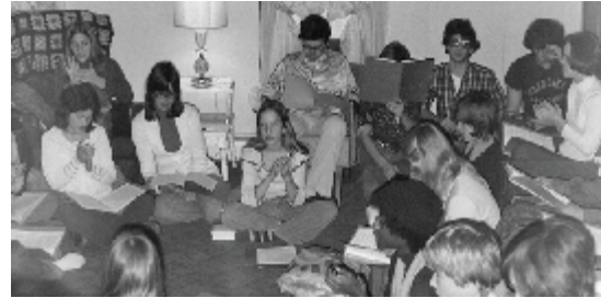
HSCF In A Home 1976