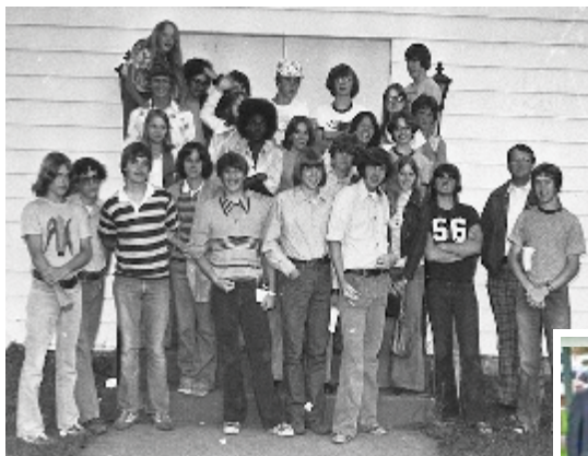
HSCF Grand Junction Congregational Church 1978