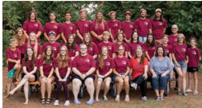
Our 50th High School Camp, July 2023