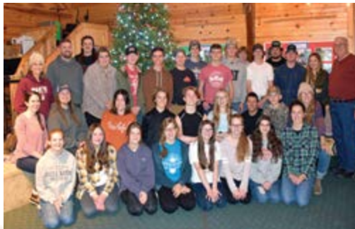
"Praise Night" Thanksgiving Eve