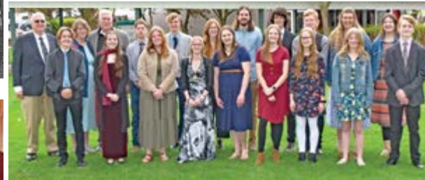
MORP Senior Appreciation Weekend