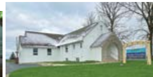
Christian Fellowship Youth Ministry Center