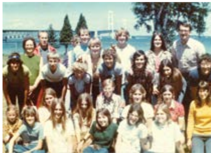
Our First High School Camp, August 1974

To our God and Father be glory for ever and ever. Amen. Philippians 4:20