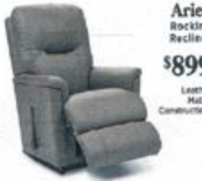
Aries Rocking Recliner $899 Leather Match Construction