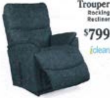
Trouper Rocking Recliner $799 iclean