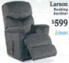
Larson Rocking Recliner $599 iclean