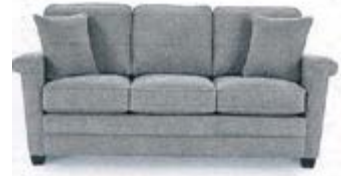
Bexley Sofa $1499 iclean available as a Sleep Sofa