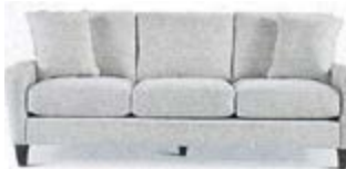
Kirby iclean Sofa $1599