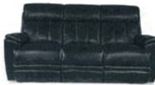
Talladega Reclining Sofa $2099 Leather Match Construction