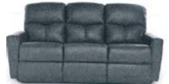
Hawthorn Reclining Sofa $1199