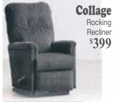
Collage Rocking Recliner $399