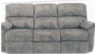
Brooks iclean Reclining Sofa $1099