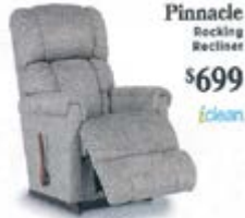
Pinnacle Rocking Recliner $699 iclean