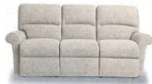
Robin Reclining Sofa $1299