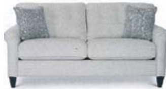
Laurel Sofa $1199