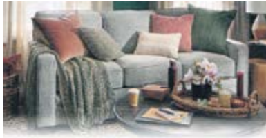
Meyer Sofa $1399 *Pillows Sold Separately