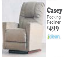
Casey Rocking Recliner $499 iclean