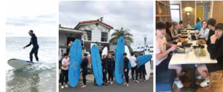
The Bangor Gone boarding class went on a trip to California this month. The students had the opportunity to surf in the Pacific Ocean and visit various organizations, businesses, and vendors.