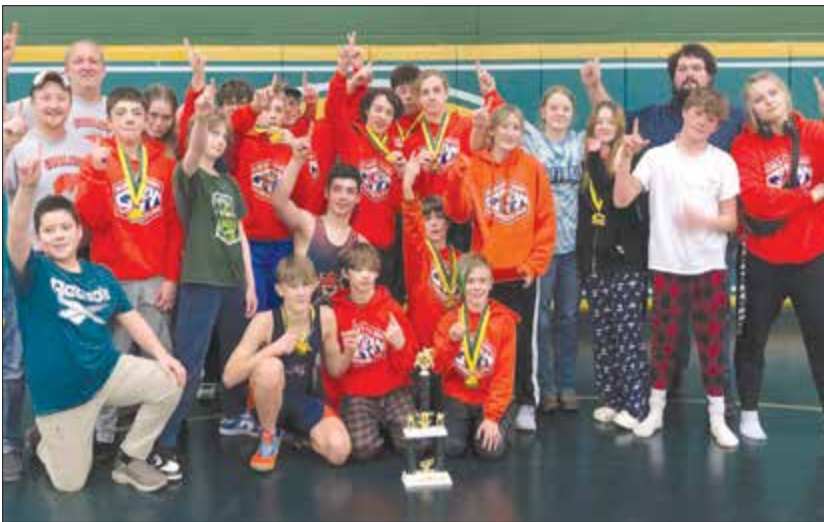
Middle School wrestlers celebrate their team win at the Colma Invitational.