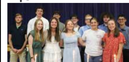
Junior NHS members