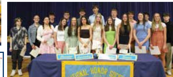
Newly inducted members of the NHS.