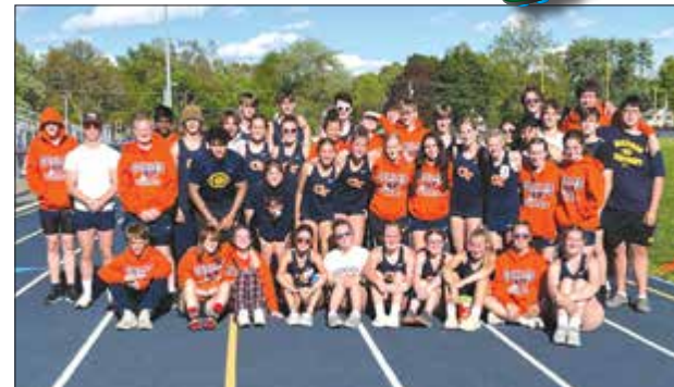
Both teams at the end of the "Little Guys" Invitational Meet, Friday, May 10.