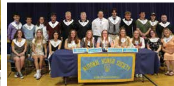
Graduating NHS members