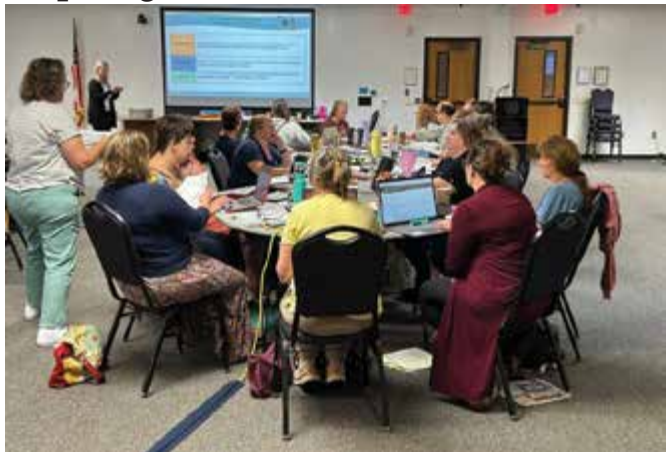
South Walnut Elementary teachers attended UFLI Professional Development at the Van Buren Conference Center this month to prepare for the new school year.