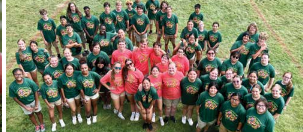
The Bangor High school band students worked hard this month during band camp, which featured lots of practice, games, food eating contest, more fun and even visits from the Bangor Community Fire Department. The weather was hot this year, so the fire department stopped by to cool the students off with the water hose. The camp concluded with a trip to Michigan Adventures Amusement Park.