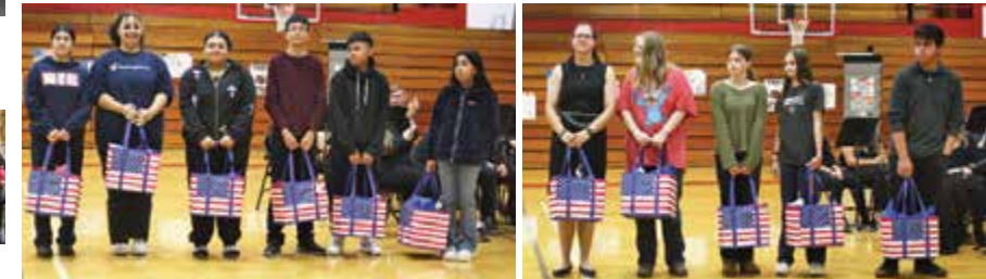
The annual Bangor Public Schools Veterans Day assembly took place on Monday, November 11.