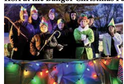
especially year's Bangor parade.