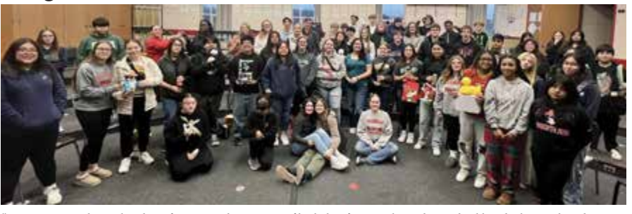
'Secret Santa in the HS band is a favorite tradition! Lots of lip balm, fuzzy socks, sodas, and rubber ducks.... Oh and some