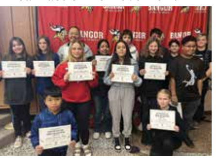
Middle school students who were chosen "Student of the Month," were celebrated during a breakfast of achievement event this month. Family members attended, and the students received certificates for their exemplary efforts during the first quarter of