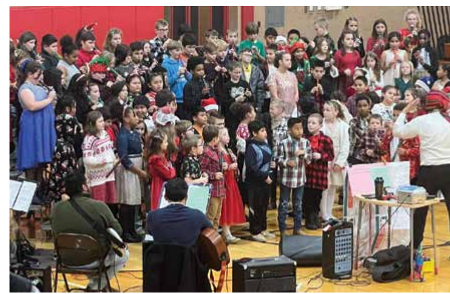
Valnut Christmas concert took place on December 18. Students from grade preschool through 4th performed, sang, and played instruments. There was also a live band to accompany the performances this year.