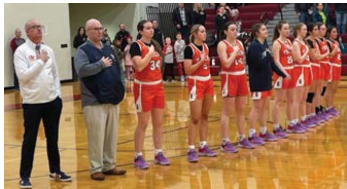
Girls Varsity Basketball Pregame at Galesburg Augusta on Feb 14th