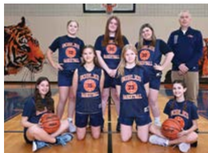
8th Grade Girls Basketball team