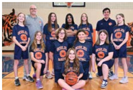
7th Grade Girls Basketball team

Both of the Middle School teams were 1-1 this week. The 7th graders beat Allegan on Monday and on Wednesday fell 2 points short of avenging a loss earlier in the season to Delton-Kellogg. The 8th graders fell to Allegan on Monday and beat Delton-Kellogg on Wednesday evening. It has been a good season and the Lady Tigers finish their season at home on Monday, March 3 v. South Haven.