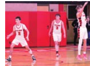
Congrats to the Varsity boys basketball team on winning the District opener last night!