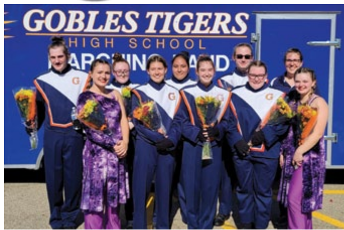
Featured here are the seniors who participated in marching season.

The Gobles Tiger Marching Band competed at five competitions this fall. They started the season by earning second place at the Portage Central Marching Invitational. Next, they earned first place at the Hastings Marching Invitational taking home caption awards for Best Marching, Best Percussion, Best Color Guard, and Best Drum Major. Later, they received third place and an award for Best Music at the Lakeshore Marching Invitational and received a division 1 rating at MSBOA District 6 Marching Band Festival. Finally, they took home second place at the East Kentwood Invitational with an award for best marching.