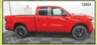
15604 Big Horn level II, Night edition, buckets, power seat, heated seats, heated steering wheel, 8.4" Touch screen, 20" wheels, tow pkg, 5.7L V-8, 8spd automatic, auto 4x4.