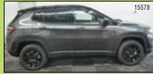
15578 Blind spot, cross path detection, active lane management, 10.1" display, two tone paint, 9spd automatic.