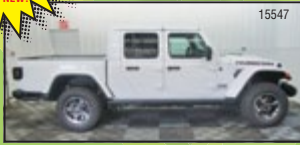
15547 Heated leather, LED light group, color matching Roof and flares, tow pkg, 3 piece hard top, 8spd automatic, 3.6L V-6, Roc-trac, and much more!