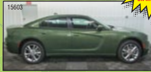
15603 Heated seats, heated steering wheel, blind spot, cross path Detection, power sunroof, 8.4" touch screen, remote start.