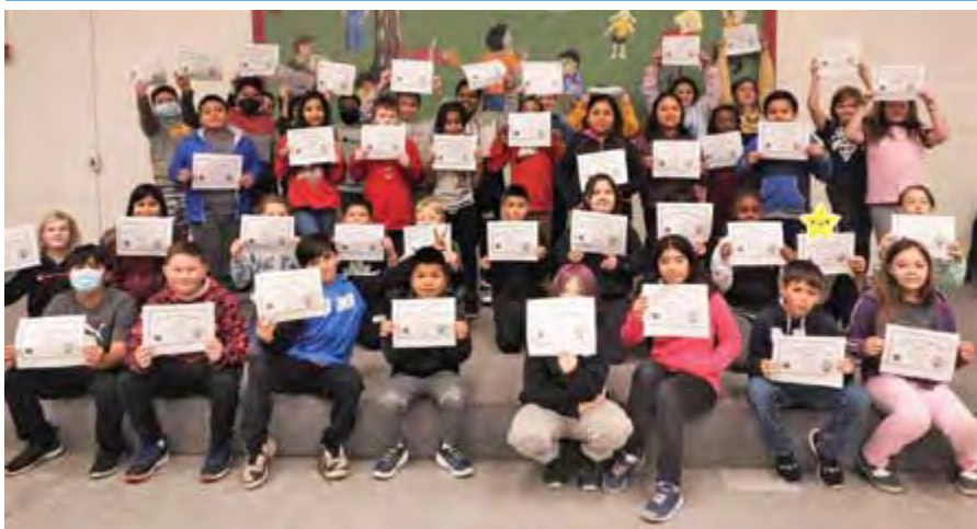
50 South Walnut students in total completed one full hour of learning computer coding!